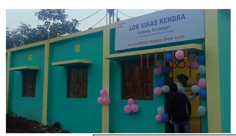
Lok Vikas Kendra Inauguration