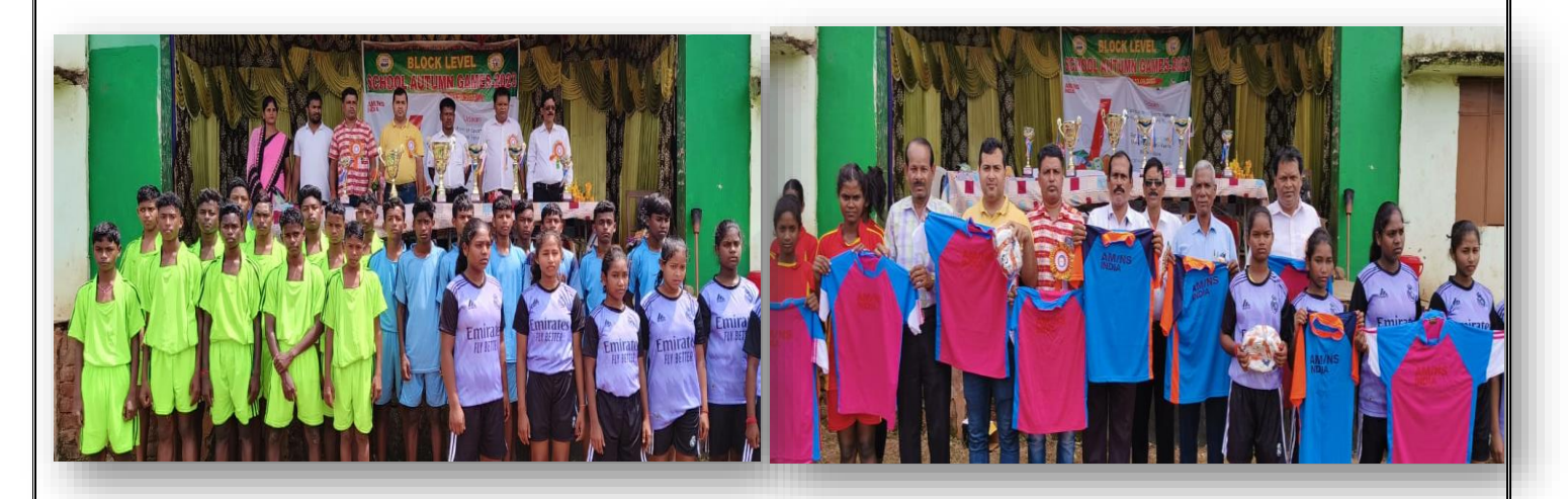
Football Tournament at Koida High school