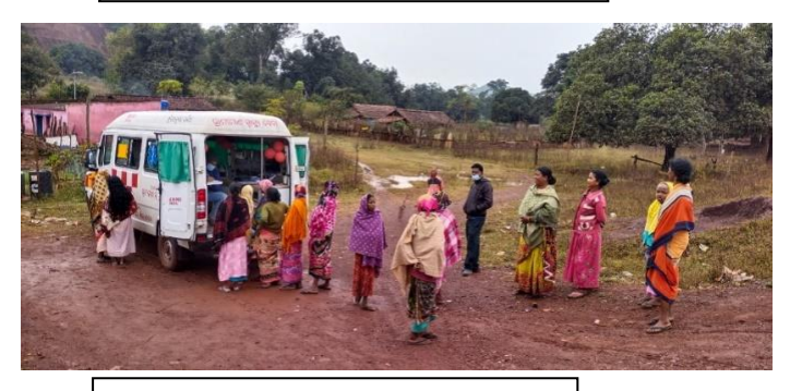
Mobile medical unit