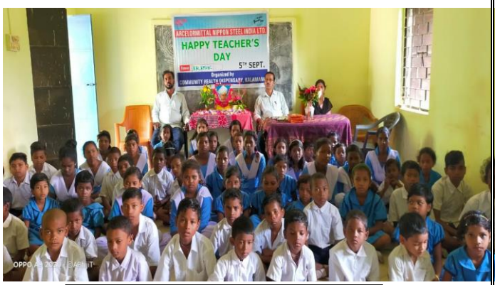
Teacher day celebration