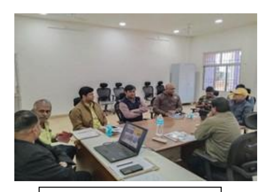
IMC meeting at ITI Koida