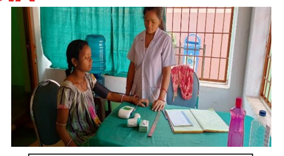
Community Health Dispensary