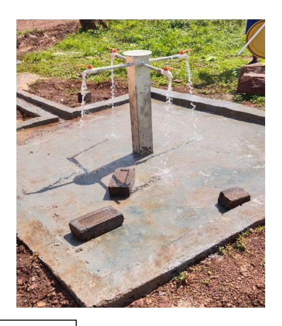
Solar based Borewell water