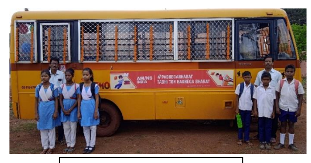
School Bus Facility