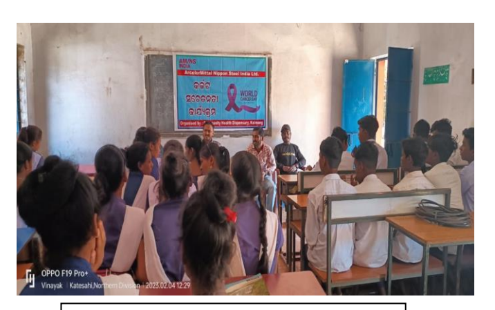
Cancer awareness session