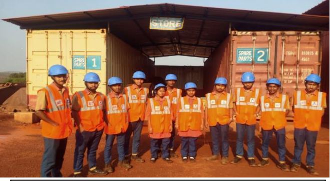
Industrial training to ITI students