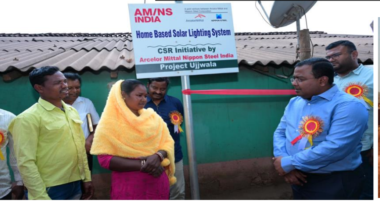
Solar based home light